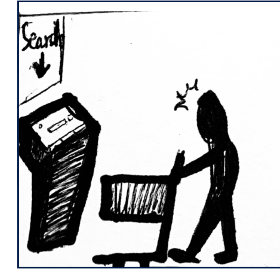
4 See the item finder device.