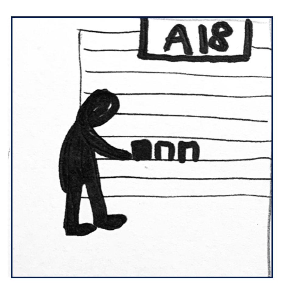
Take the item.