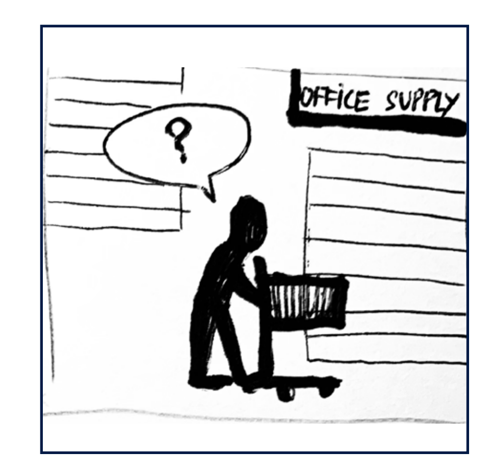
Arriving the first guess Don't see the item there.