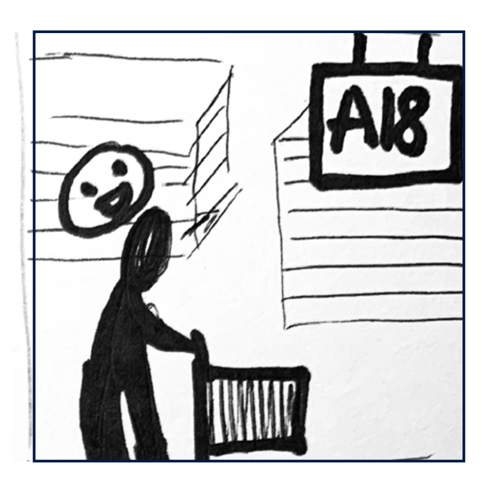
Find the aisle.