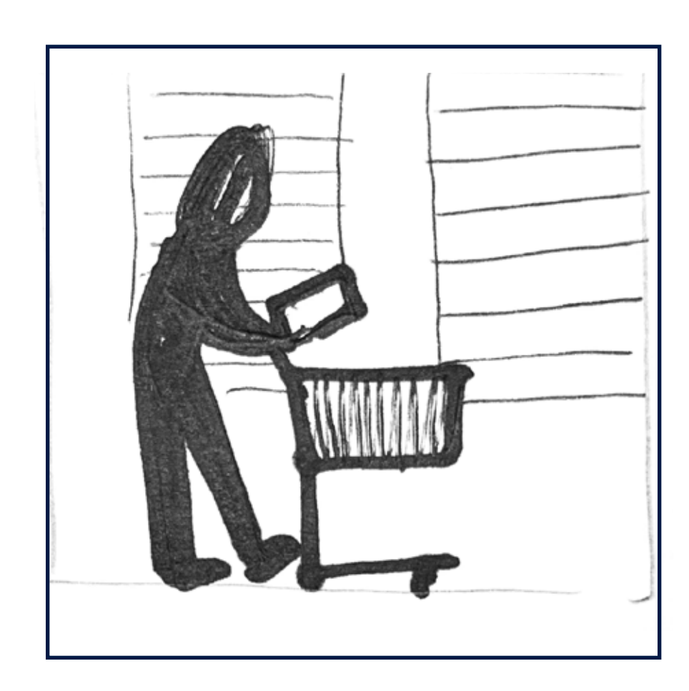
7 Follow the number on it.